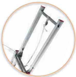
Exit Rail onto Platform