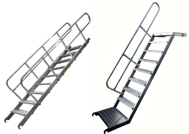
OPTIONAL: HANDRAILS &/OR LANDINGS (SINGLE OR DOUBLE)